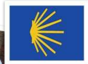
The symbol of the Camino de Santiago